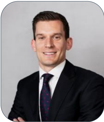
Chair of ESG Committee & Head of Asset Management

Performance is tracked on an ongoing basis and reported in monthly working group meetings. Overall performance against our actions and long-term objectives will be reported on an annual basis to our investors and wider stakeholders through our annual ESG performance report, which will also be available on the website.