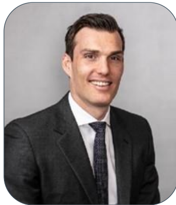
Chief Executive Officer